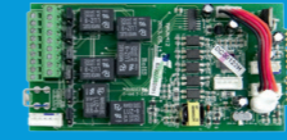
■ Dry Contact Board (DCE-C)