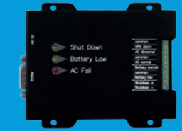
■ External Dry Contact Box (DCE-E)