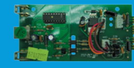
■ USB Card